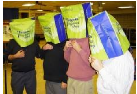
The Unknown Quartet "auditions" for the chapter

27 Cider Press deadline, March/April issue