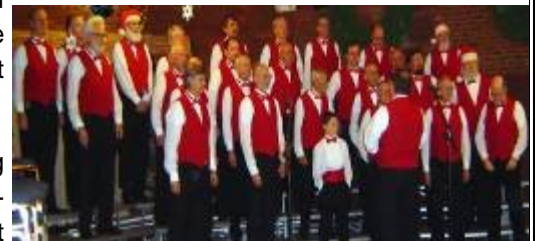
Akron Derbytown Chorus at Children's Hospital

"The best way we can perpetuate the music we love is to instill that love in a new Barbershop fan. This needs to become second nature to everyone in the chapter."