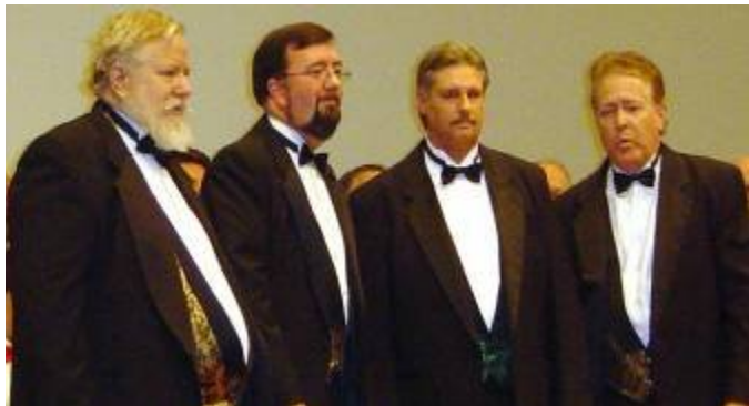
Clear Choice quartet fronts the Akron Derbytown Chorus at Medina Retirement Village