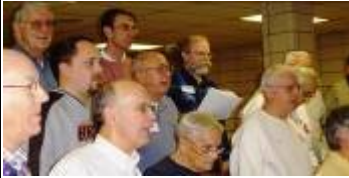
Tuesday evening chorus rehearsal

The Akron Chapter was well represented on December 4 and 5 at the Chapter Operations Training Seminar in Columbus, Ohio. Eleven of our members were there to learn as much as they could about how to help make this chapter bigger and better than ever. Two of them agreed to share their reactions to COTS with Gazette readers.